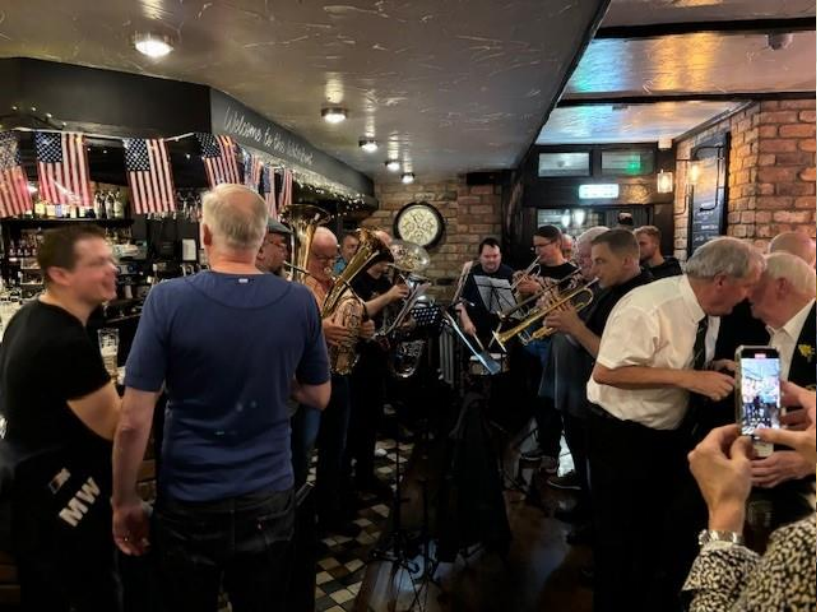
The 'oompah' afterglow will never be surpassed...