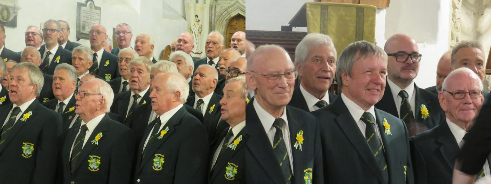
Space was at an absolute premium as our choir continues to grow in numbers...