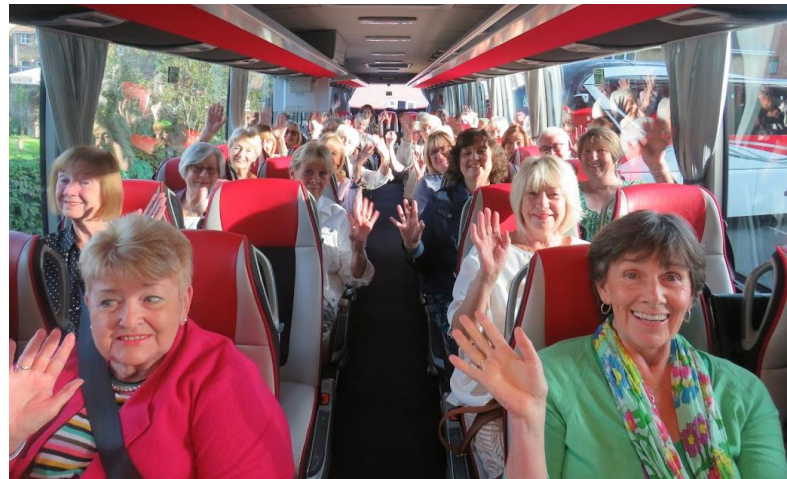
Supporters packed coaches for the concert!

Our performance at Newport was completely sold out and we did the occasion proud, delivering a genuinely stand out concert. Bravo to all members of our music team.