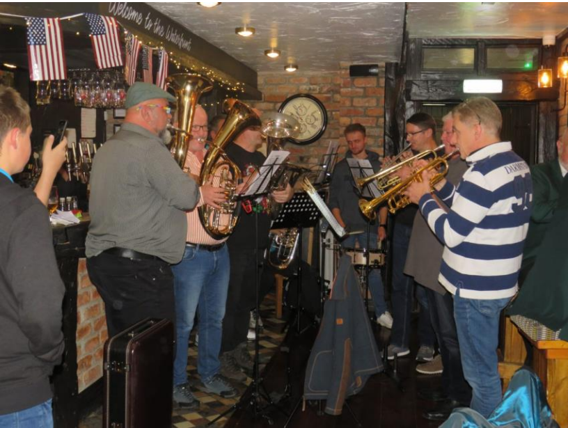
Tuesday evenings will never quite be the same again. What a fabulous occasion!