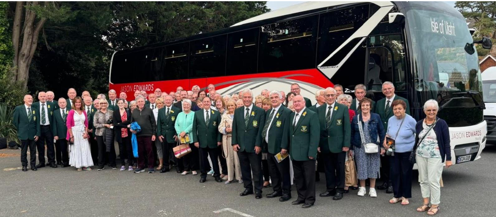
The tour party less a few who had sprinted for an earlier ferry!

The Choir was honoured and delighted to accept an invitation from Rotary Isle of Wight to visit and be the first performers in the newly refurbished Newport Minster in early September. A cohort of nearly 50 choristers together with an enthusiastic band of supporters gathered to enjoy the coach journey and immensely smooth ferry crossing to the Isle.