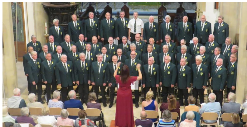
Newport Minster was full!